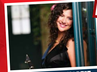
ANAT COHEN QUARTET