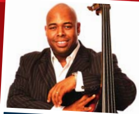
CHRISTIAN McBRIDE & INSIDE STRAIGHT