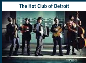
The Hot Club of Detroit

Saturday, Nov. 10, 2012 3:30 p.m. & 8:30 p.m. Winnipeg Art Gallery