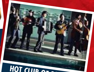
HOT CLUB OF DETROIT