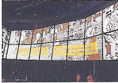
A scene from one of the four out of 11 galleries that was open to the public the weekend of September 20-21.

The morning ceremony began with blessings from elders representing the Anishanabe, Metis and Inuit peoples. Internationally-known Canadian songstress Ginette Reno sang our national anthem. Interspersed between the speeches were performances by local singing sensation Maria Aragon