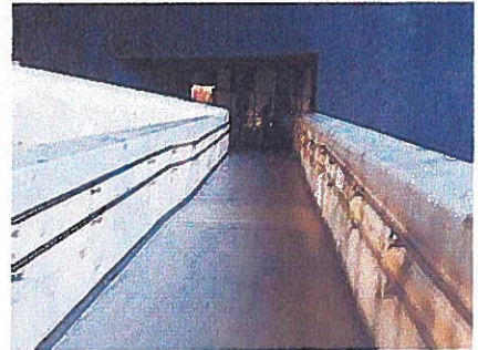
The alabaster walls that line the ramps of the museum are breathtakingly beautiful.

By any measure, the opening of the Canadian Museum for Human Rights is a tremendous success story which will have the intended positive impact on Canadians and people all around the world for many years to come.