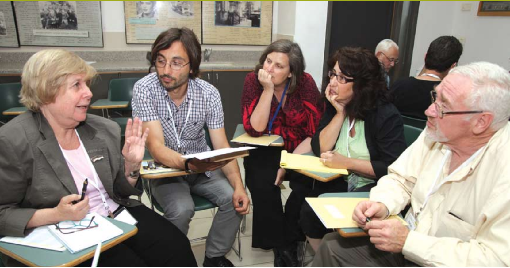
■ Participants at one of the 81 professional workshops held during the three-day conference

The Eighth International Conference on Holocaust Education