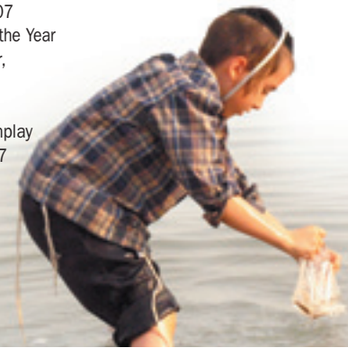
My Father My Lord

Internationally-acclaimed and award-winning films