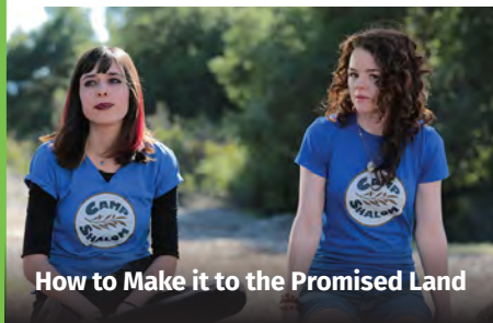
How to Make it to the Promised Land