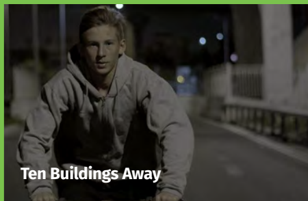
Ten Buildings Away