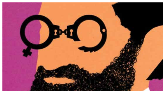
Panel discussion on 25th anniversary of R. v. Morgentaler