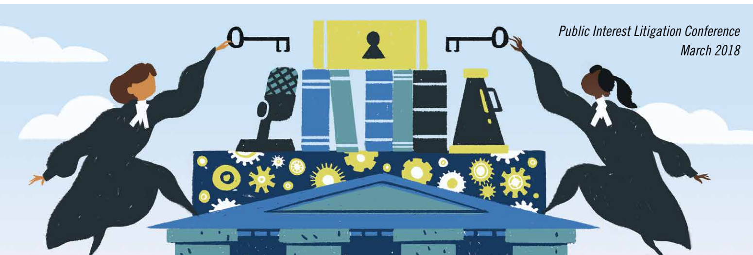
Public Interest Litigation Conference March 2018