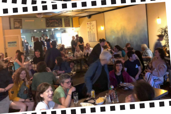
2019 Shorts on Sherbrook